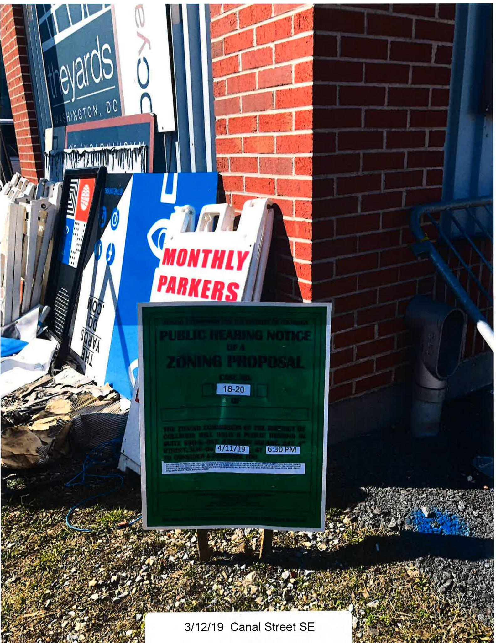
3/12/19 Canal Street SE