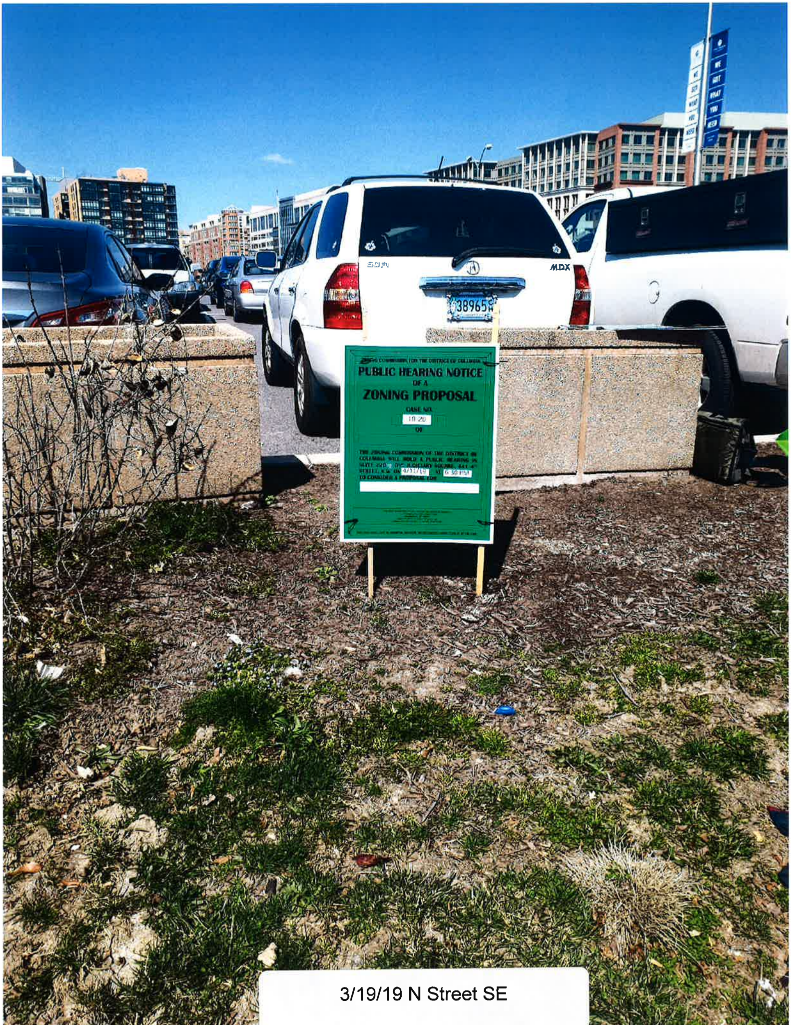
3/19/19 N Street SE

ZONING COMMISSION (ON THE BEHALF OF COLUMBIA) PUBLIC HEARING NOTICE OF A ZONING PROPOSAL CASE NO. 10-20 OR THE ZONING COMMISSION OF THE DISTRICT OF COLUMBIA WILL HOLD A PUBLIC HEARING ON MAY 20 th 7:00-8:00 P.M. IN ROOM 441-4 STREET, N.W. ON 423-1719 AT 6:30 P.M. TO CONSIDER A PROPOSAL FOR