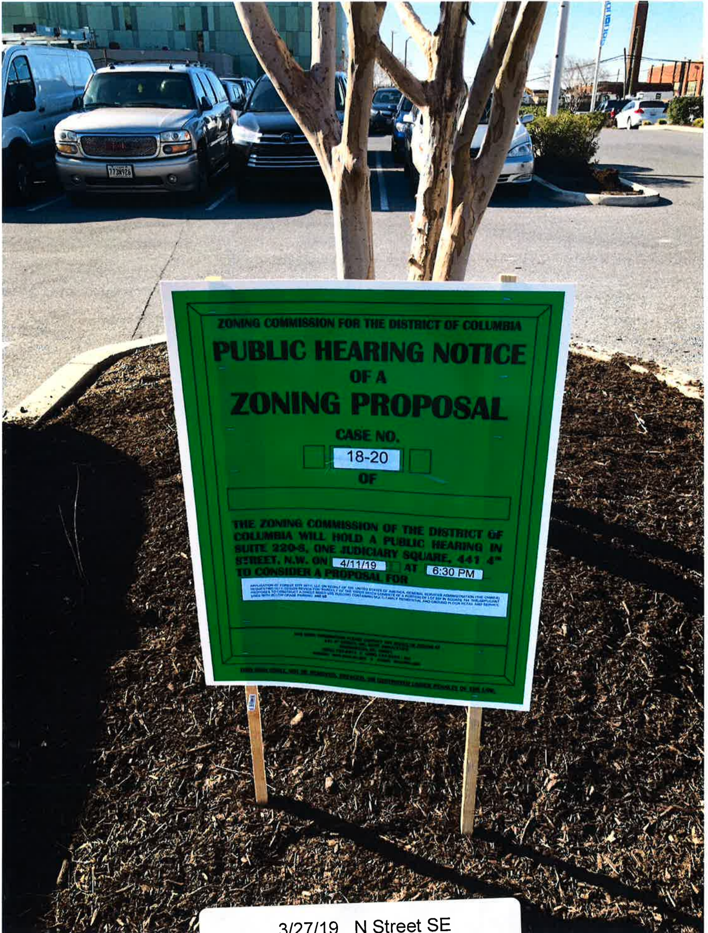
3/27/19 N Street SE